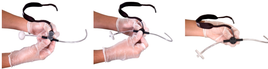
Figure 2: Using the snap-fit connector attach the mouthpiece to the headset.