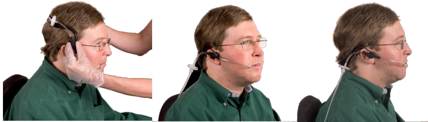
Figure 3: Slip headset over the head and behind the neck

The switchbox has two connectors for the sip and puff switches and a pneumatic connector for the headset. The electrical jacks use 3.5mm connectors that are typical for adaptive switches. The switch contacts are normally open; closure is made with a sip or puff to the tube. The switches are designed for low current and low voltage applications.