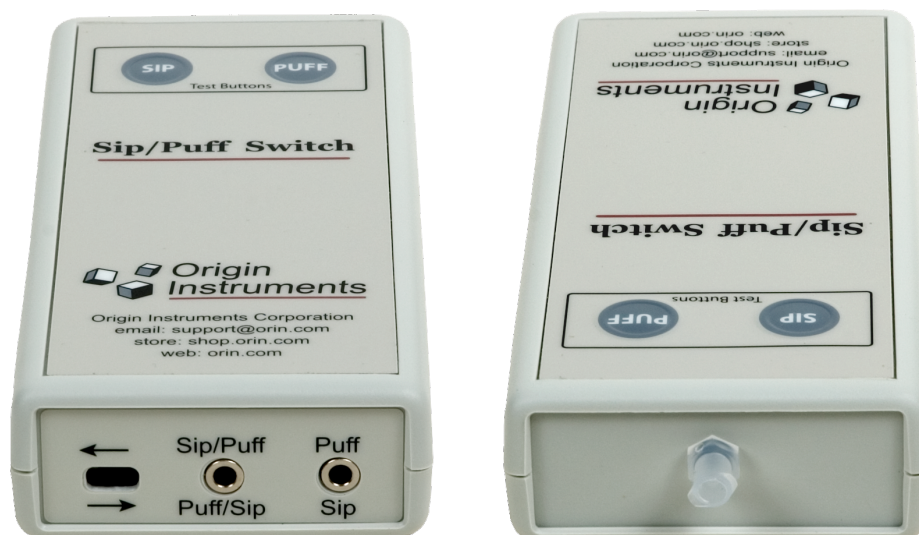
Figure 4: Left: Switchbox electrical connectors and connector sense selector. For sip and puff over one cable, plug a stereo cable into the center jack. (Notice the sip and puff test buttons.) Right: Pneumatic Connector

The switchbox has two connectors for the sip and puff switches and a pneumatic connector for the headset. The electrical jacks use 3.5mm connectors that are typical for adaptive switches. The switch contacts are normally open; closure is made with a sip or puff to the tube. The switches are designed for low current and low voltage applications.