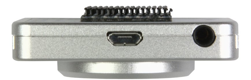
Figure 2: HeadMouse Nano Top View. USB Micro-B in the middle, and 3.5-mm jack for one or two adaptive switches.

Located on the top edge of the HeadMouse Nano are a Micro-B USB connector and a 3.5mm (1/8-inch) stereo microphone connector. Connect a mono adaptive switch into the microphone connector to provide a LEFT mouse button click. A dual-mono-tostereo adapter is available if you need to directly connect mono adaptive switches for both LEFT and RIGHT mouse button clicks.