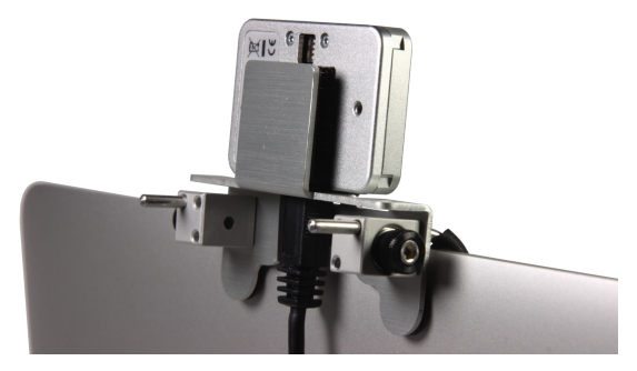
Figure 5: HeadMouse Nano with universal bracket.

The universal bracket is designed to attach the HeadMouse Nano securely to a variety of device displays – desktop, laptop, tablet and communication devices. The adjustable bracket can