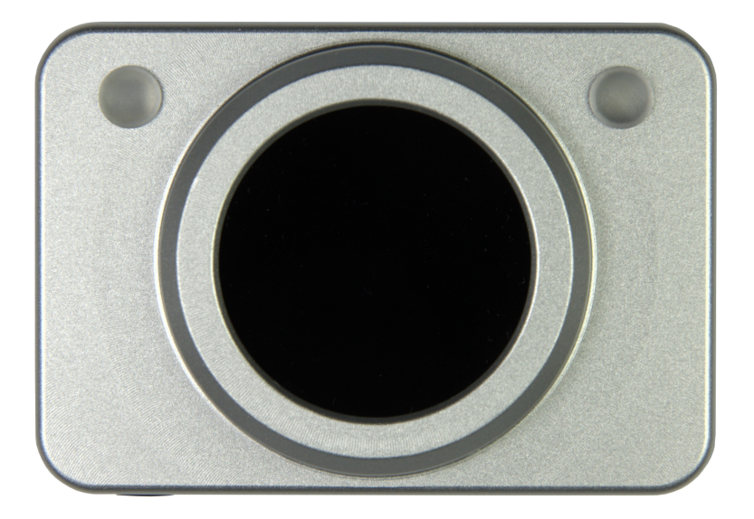
Figure 1: HeadMouse Nano Front Panel. Optical tracking sensor in the middle, infrared receiver for available Beam on the left and status LED on the right.

The aluminum body of the HeadMouse Nano measures 2.1- by 1.5- by 0.35-inches, the optical transceiver extends another 0.15-inches. For best results and reliable long-term operation, do not touch the dark window. It is not necessary to clean the window as part of a regular maintenance program.