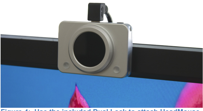
Figure 4: Use the included Dual Lock to attach HeadMouse directly to the monitor bezel.

The pressure sensitive adhesive used on Dual Lock is powerful and not easily removed. To remove, gently peel Dual Lock away from your monitor. Excess adhesive can then be removed with an appropriate adhesive removing solvent.