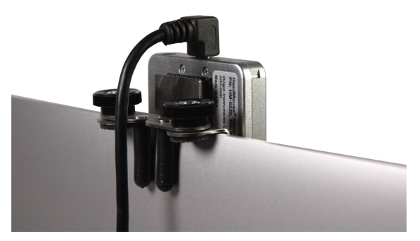
Figure 8: An available front mount bracket style

A front mount style backet is available that uses two rotating and rubber tipped arms that clamp the display to its padded front tab. Simply squeeze the display between each arm and front tab while tightening the thumb nut. The arms may be rotated in, as shown in the figure, or rotated out.