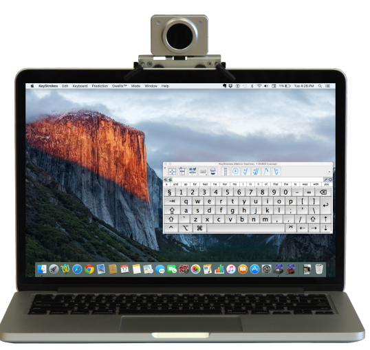
Figure 6: HeadMouse Nano with universal bracket on a laptop computer

After attaching the mounting bracket to your device, simply snap the HeadMouse in place.